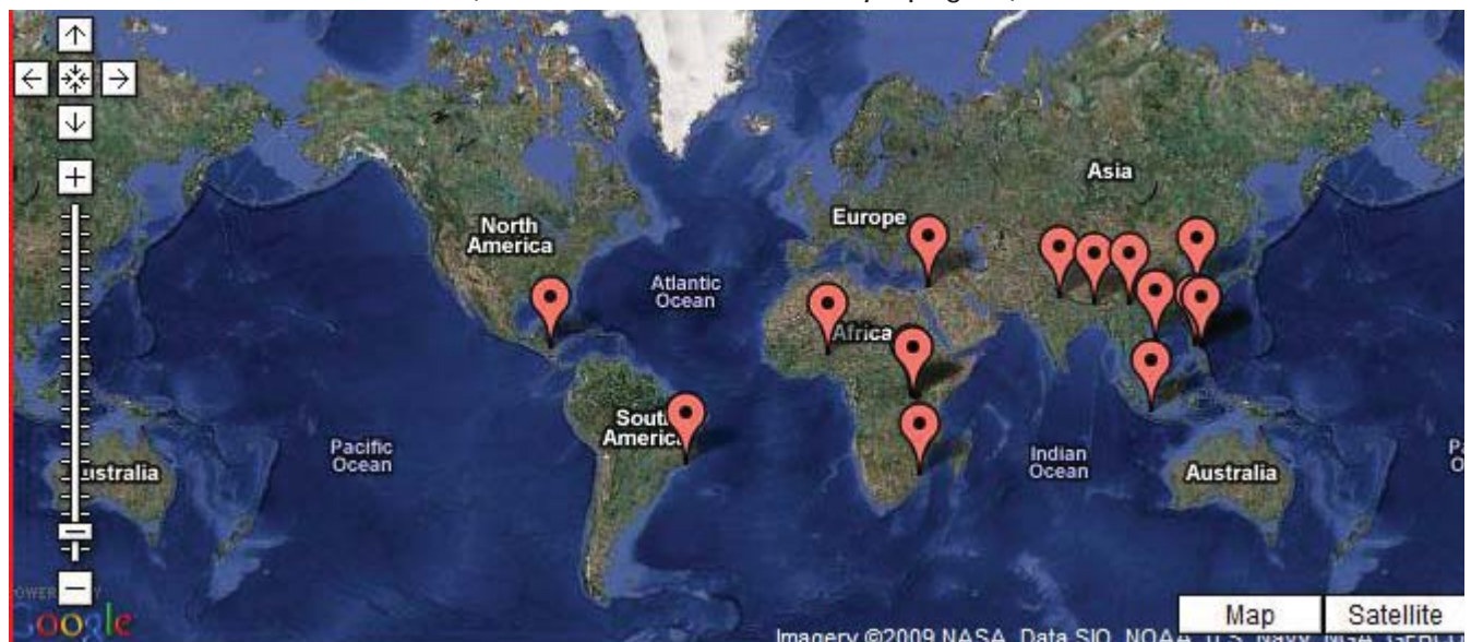
SKJ activity spans the globe! ( global.wisc.edu/skj/stories/ )